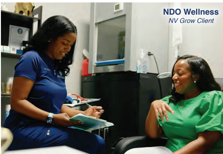
NDO Wellness NV Grow Client

Our diverse and bilingual staff can deliver counseling, resources and translation services in multiple languages.