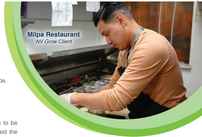
Milpa Restaurant NV Grow Client

NV Grow models the concept of Economic Gardening, a strategic approach that connects entrepreneurs to essential data, marketing, and business intelligence resources. This wealth of information empowers you to make well-informed decisions, optimize your operations, and tap into new opportunities for growth. By nurturing your business's growth potential, we aim to help you create jobs and strengthen the local economy.